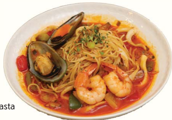
Seafood Spicy Soup Pasta

Sliced Beef, Mushroom, Capsicum, Broccoli, Chilli, Spaghetini, Homemade Spicy Soup