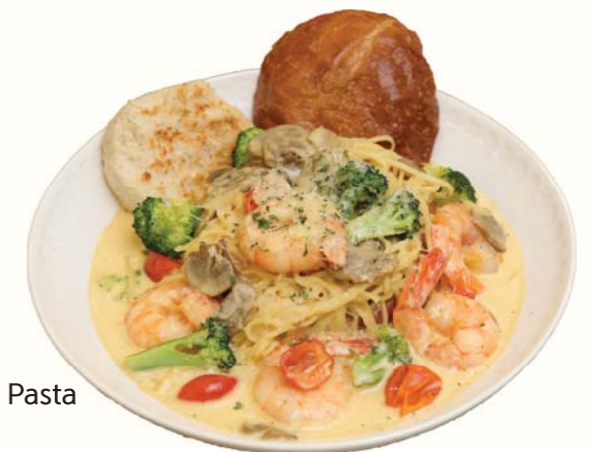
Prawn Cream Pane Pasta

Homemade Cream Sauce, Bacon, Onion, Mushroom, Broccoli, Cherry Tomato Chilli, Parmesan Cheese, Spaghetini, In Whole Round Sourdough